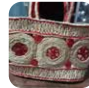
School Lunch Basket